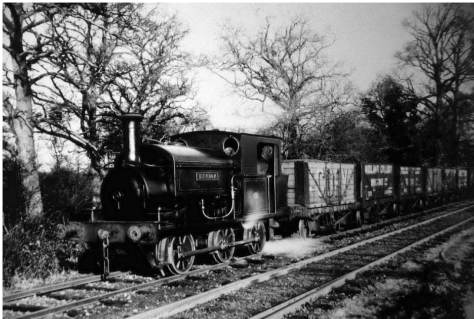
The engine 'Hendon' in January 1938 opposite 'Four Acre Wood'