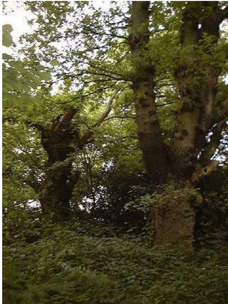
Ancient Oak Pollards on Epsom Common

Today we manage the Common to allow good public access, whilst at the same time maintaining and improving the ecological diversity of the site. The Common has a range of distinctive habitats from mature ancient Oak woods, to developing Birch and Oak woods, to Hawthorn Scrub, to grazed open acid grassland with Heather and finally a variety of wetlands.