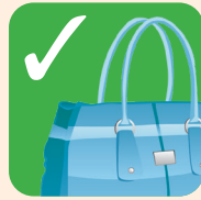
Bags and belts