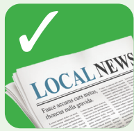
Paper (not shredded)