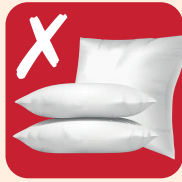
Pillows and duvets

Remember – Items must be clean, dry and placed in a tied, clearly labelled bag next to your bin.