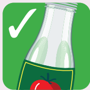
Glass bottles and jars of any colour