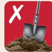
Soil and stones

Remember – Small amounts of shredded paper can go in your garden waste bin. To subscribe to the garden waste collection service, visit epsom-ewell.gov.uk/gardenwaste .