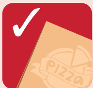
Greasy pizza boxes