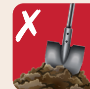
Soil and stones

Remember – Subscribe to the collection service – details online. Garden waste can be composted at home – order a discounted compost bin online at surreyep.org.uk