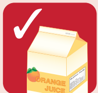
Food and drinks cartons