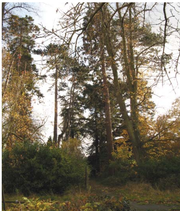
A Tree Management Plan is needed