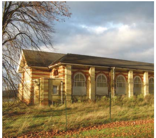
Listed chapel, Horton Conservation Area