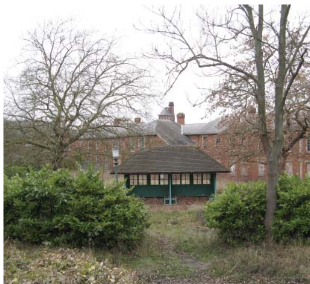
View into the former hospital site showing a patients' shelter