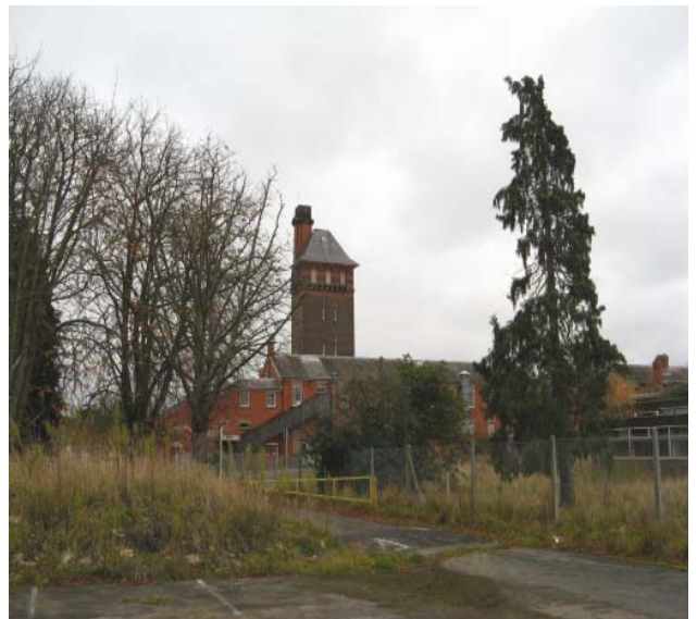
The listed water tower must be preserved