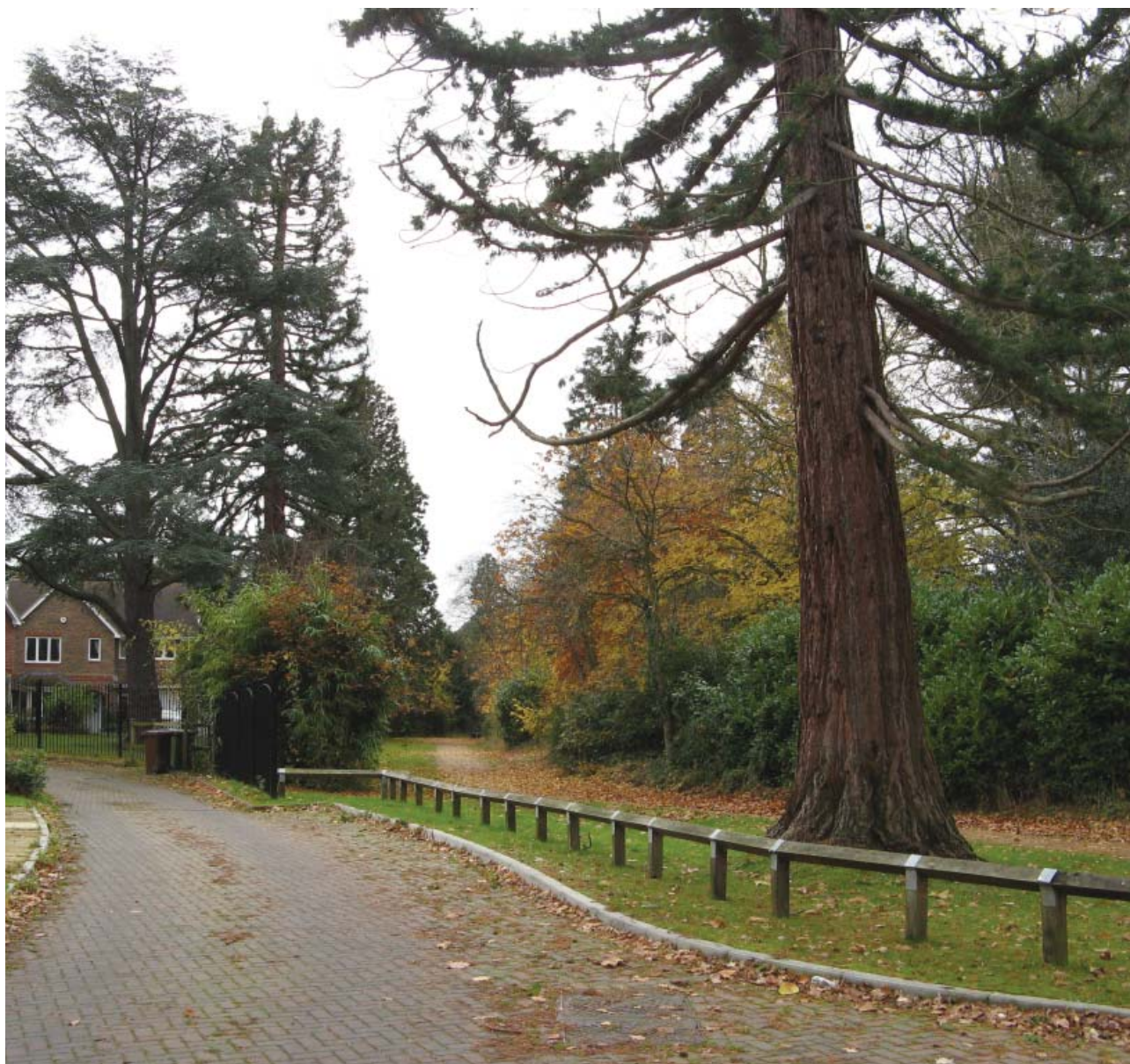
Trees in the Long Grove Conservation Area