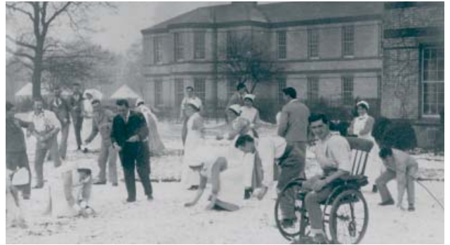
Patients and staff playing in the snow outside Horton Hospital

The erection of the hospitals had placed considerable strain upon the original roads servicing the Horton Estate such as Horton Lane and Hook Road, both of which were little more substantial than a country lane. 'The miseries endured during that period by those dwelling along the route will long be remembered 'with a feeling akin to indignation', recorded the Epsom Herald in 1905. 'The constant vibration of houses, the falling of ceilings ... and the ultimate burden of a special rate of sixpence in the pound towards the reparation of the road' would, it continued, long be associated in local memory with the building of Long Grove asylum.