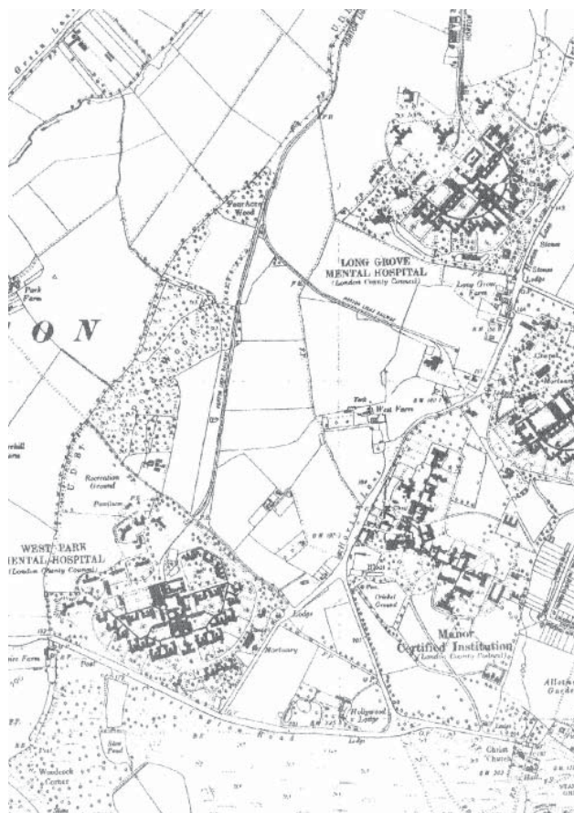
Historic map of 1938