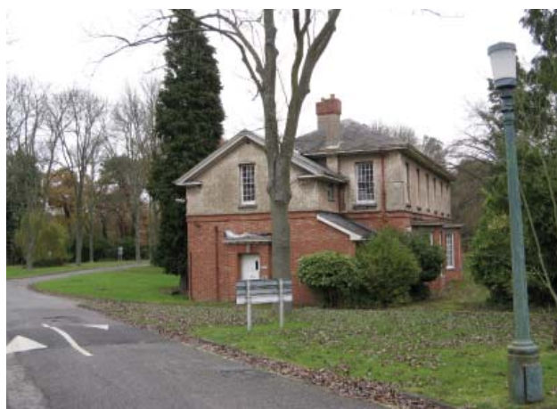
Villa close to Ramsey House