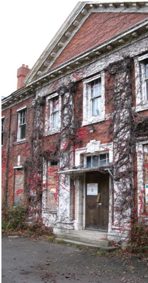
Front elevation, main entrance block

Only the burnt out roof of this building is visible over the roofs of the surrounding buildings, but the building must once have provided an important facility for the patients and its loss is greatly to be regretted.