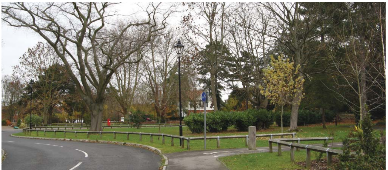
The mature trees and sensitively designed landscaping are important features in the Long Grove Conservation Area

The rural setting to the Cluster, and the survival of much of the historic landscaping around each hospital (much of which was planted by the hospital authorities) means that even today, the area is notable for its leafy character and open green spaces. These have been successfully enhanced in many places by the housing developers, with careful attention to details such as fencing, road layout, provision of public open space, and the creation of footpaths across the various sites. There are many fine 'specimen' trees, such as Wellingtonias, around the various sites, which add to the ambience of the whole area. Despite the very high density of some of the housing development, which replicates the density of the previous hospital buildings, the whole area retains a strongly rural character, assisted by open spaces such as the fields between Long Grove and St Ebba's, the open grassed area around the east side of what was Horton Hospital, and the fields and open spaces to the south of the former Manor Hospital, which provides an attractive setting to Hollywood Lodge. The continued protection of these open spaces from any further development should be ensured by policies in the Local Plan and the emerging Local Development Framework.