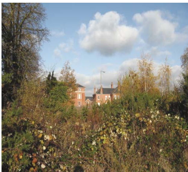
The medieval moat is hidden below these trees and shrubs