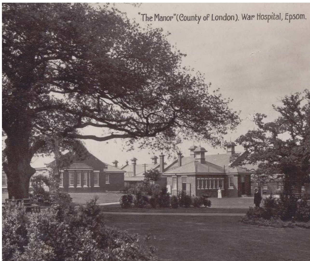
Historic photograph of the Manor Hospital

Horton was the first Hine-designed hospital at Epsom and followed the principles already established at both Claybury and Bexley. Joined by a long semicircular corridor, the wards, designed to take a total of 2,000 patients, occupied the peripheral ranges. Behind, the spine of the hospital comprised the great hall, the kitchens and the water tower; to either side, bordering the enclosed courts, were the staff quarters, maintenance workshops, an upholsterer's workshop and needle room, and the vast laundry. A free-standing chapel and mortuary were situated to the rear of the site.