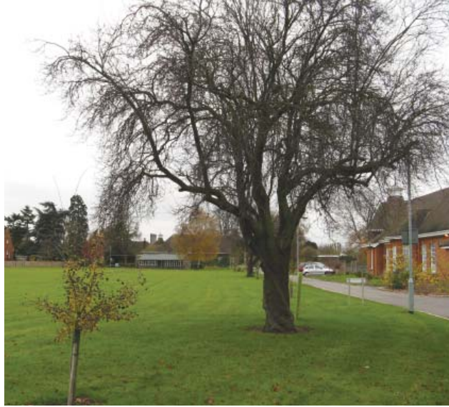
View across the green, St Ebba's Conservation Area