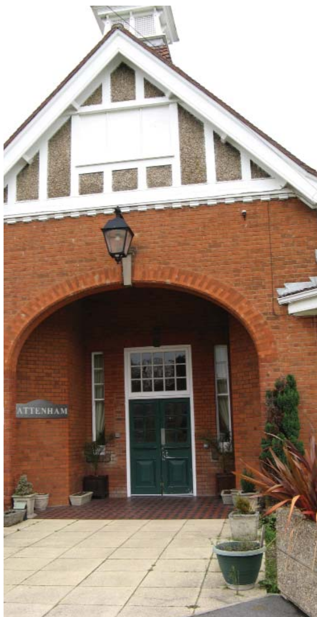
Gable detail, Tattenham villa

The villas are basically single storey (though there are casement windows in the gables) and built in a dark red brick with steeply pitched roofs covered in machine made clay tiles. The large sashed windows, with stone keystones and rubbed brick arches, lie below a heavy wooden eaves cornice. The gables ends of each building are decorated with stone copings, supported on stone corbelling. Each building is basically L-shaped, with a principal entrance at the corner of the 'L', defined by an attractive, recessed porch area enclosed by a wide brick arch. Above this, a timber gable is topped by a tiled and wood corner turret, redolent of a small bell tower to a church or chapel (a similar detail is seen on other buildings in the Cluster, such as the former lodge to Grove Park Hospital). The main entrance is set into the building, clearly designed to provide shelter from the elements, with a pair of panelled doors. All of the villas also have attractive open verandas with cast iron columns which run along parts of the elevations.