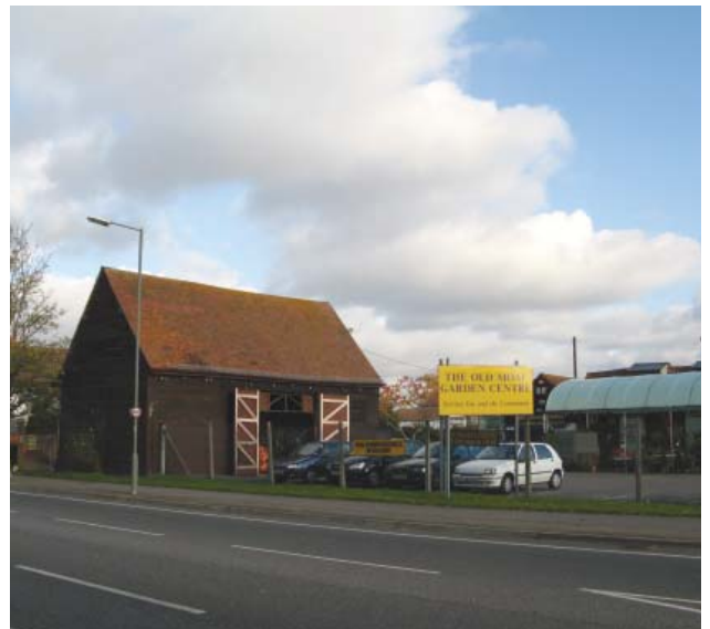
The listed barn at the Old Moat Garden Centre