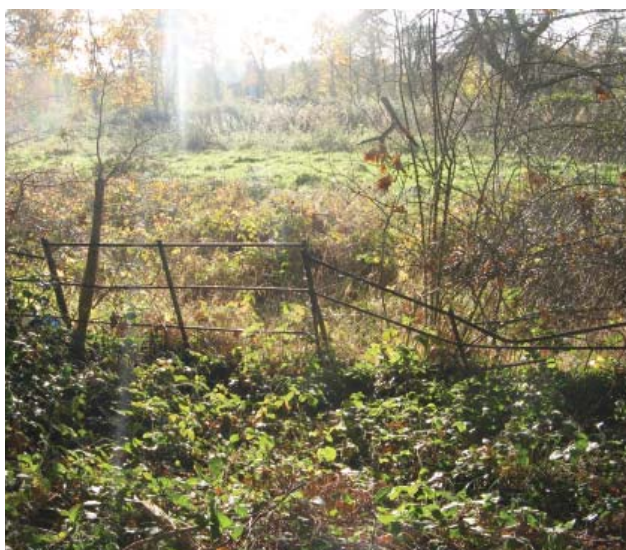
Dense woodland and 19th century park railings close to the former Horton Manor House