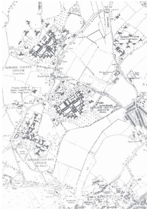
Historic map of 1914

The first of the hospitals to open was The Manor Hospital. Accepting its first patients in 1899, the institution was initially planned as a temporary measure and reused the original Manor House while the construction of a purpose-built asylum, the neighbouring Horton Hospital, was underway. The Manor House became the administrative block, and new buildings to house the necessary stores, kitchens, laundry buildings and medical officers' quarters were constructed from matching red brick. For speed, the single-storey wards, which housed some 700 female patients, were built using timber which was clad and roofed with corrugated metal sheets. Designed by William Clifford-Smith, these 'temporary' structures were first granted permission to be used for 15 years. However, despite an outbreak of fire in similar buildings at a further LCC-owned asylum, Colney Hatch, which resulted in the deaths of 51 patients, permission for the buildings at The Manor Hospital was repeatedly extended and the wards were only finally demolished during the 1970s.