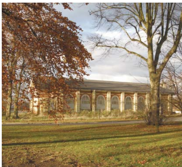
Horton Chapel listed grade II

Balfour House, which is located opposite the chapel, is a symmetrical block with a central entrance bay. The building is two storeys high and