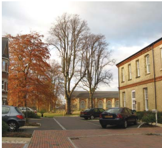
View towards Horton Chapel with new development on left