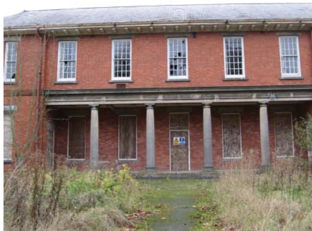
Well detailed red brick building at the former hospital