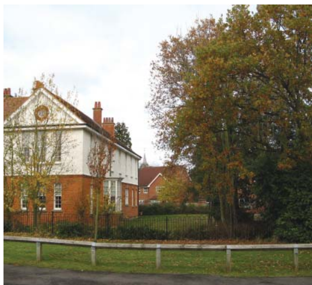
Retained villa with new development behind