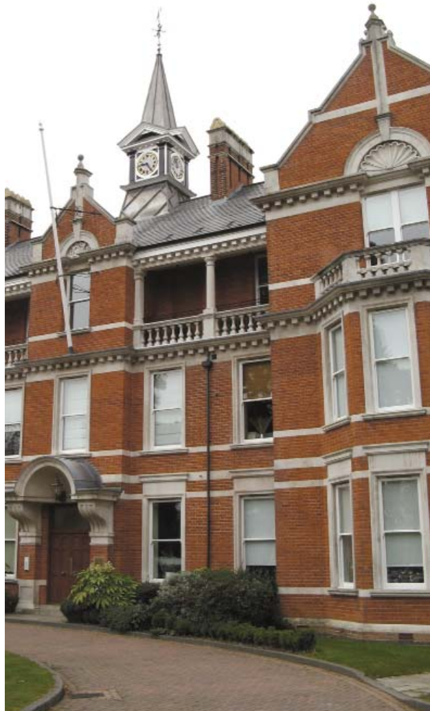
Main entrance, Prospect House

Within the conservation area is one surviving detached villa, now called nos. 1-8 Grove Close. This is a robustly detailed building, two storeys high, with red brick to the ground floor and rough cast, painted white, above. The building is a simple L-shape, with nine over nine sash windows, pitched roofs covered in machine-made clay tiles, and prominent but simply detailed red brick chimneys with clay pots. The severity of the building is reduced by canted bays windows to the ground floor and the use of keystones to the ground floor windows. The overall style, as with the échelon extensions to the main building, is stripped-back 'institutional' Georgian.