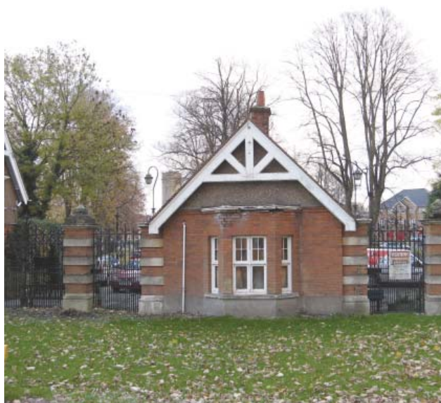
The former gate keeper's office