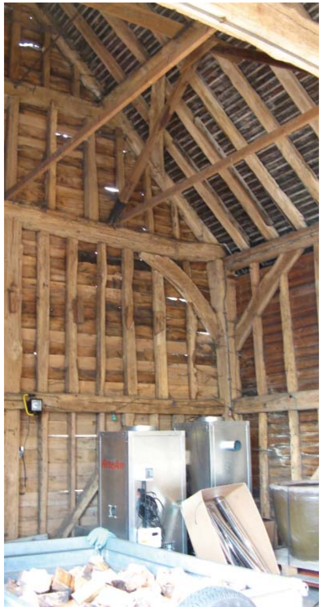
Inside the listed barn