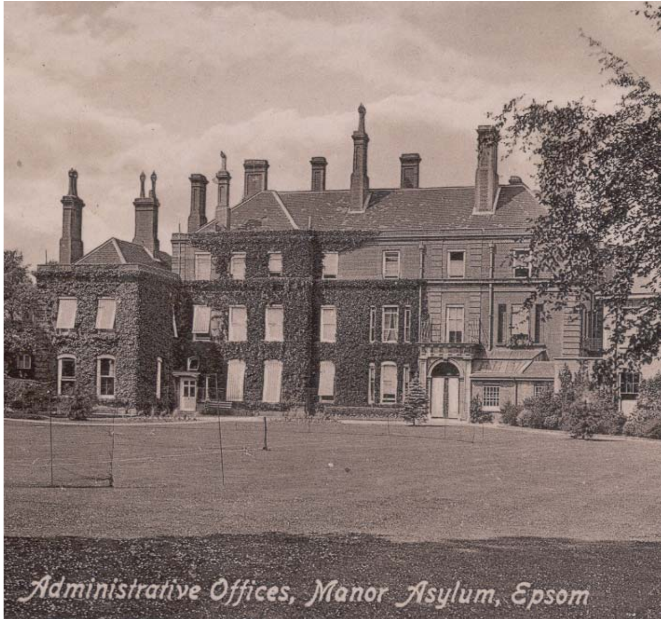
Historic photograph of Horton Manor House c1910