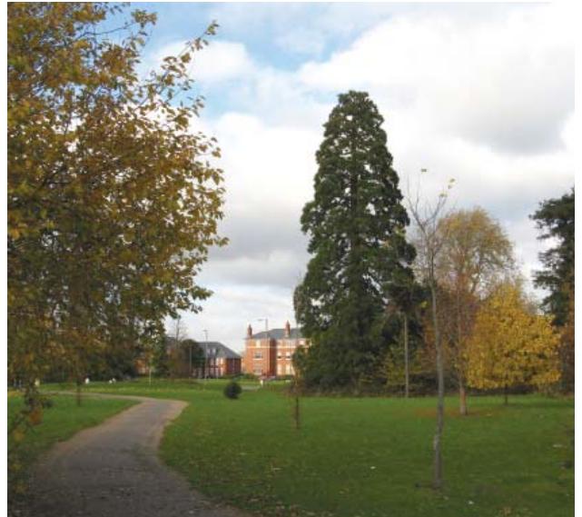
A Wellingtonia tree in The Manor Conservation Area

There is just one listed building, the barn at the Old Moat Garden Centre, which dates to the 18th century. It is timber framed and faced with black stained timber boarding, and contains a queen post roof which is covered in handmade clay peg tiles. This building is a key element in views along Horton Lane, which is located immediately next to it. Close by, two buildings remain which are shown on the 1866 map – the first, a single storey former stable roofed in clay peg tiles which has now been converted into offices and a sales area for the Garden Centre, and the second, another single storey building roofed in clay pantiles, which is used as a store.