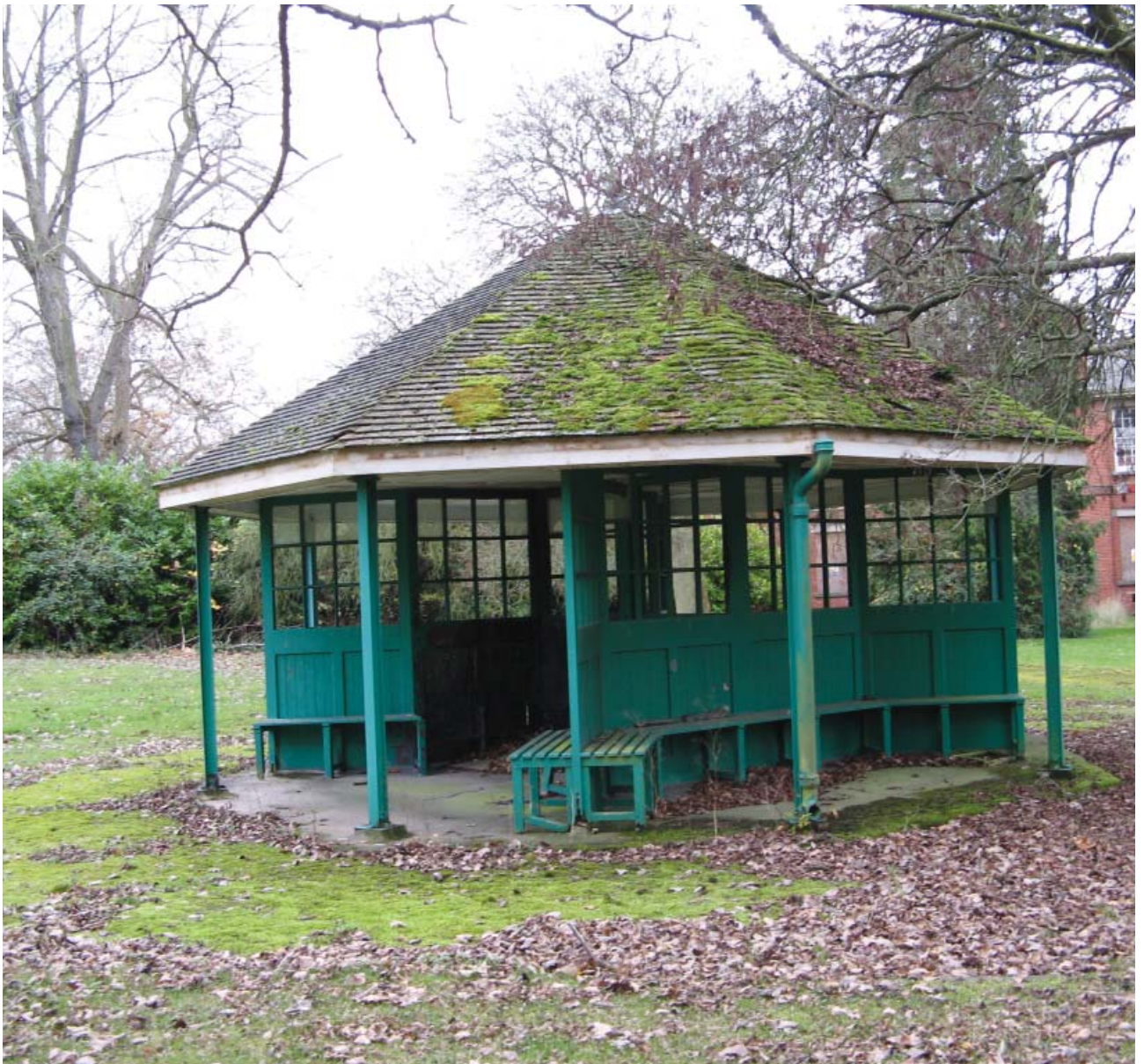
A patients' shelter