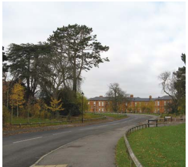
Entrance into Clarendon Park