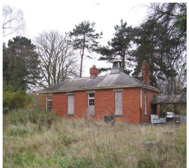
Part of the former isolation hospital