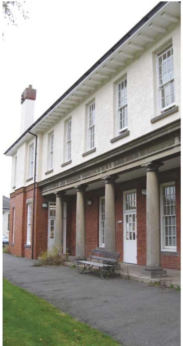
The main block of the Cottage Hospital

Free standing villas lie to the south of this principal block, now Rosebery and Ramsey House and a similar villa to the west. To the north, another group of villas lies to the east, grouped around a pleasant garden, and to the west, are further detached villas which once formed the buildings for the isolation hospital, with further villas beyond, which are now part of the Cottage Hospital. These also face an open space, with a bowling green still in use providing a central focus.