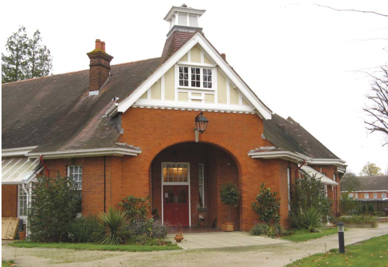
Original clay roof tiles on Sheiling villa