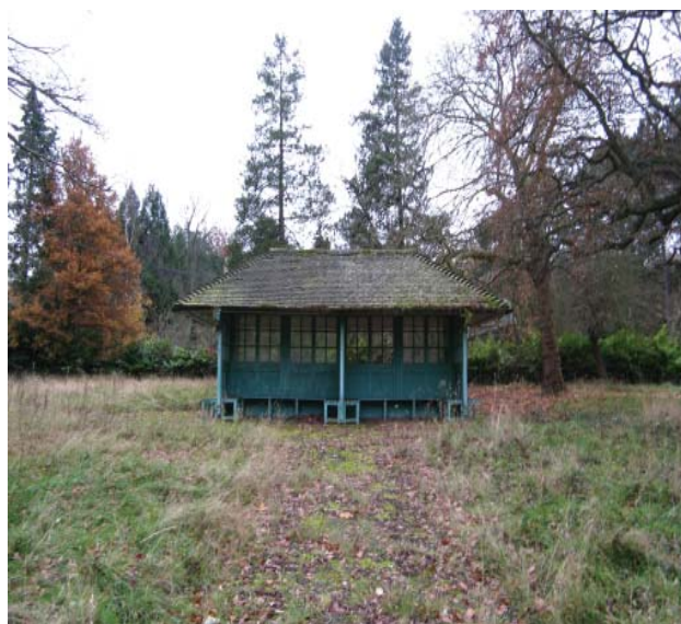
A patients' shelter