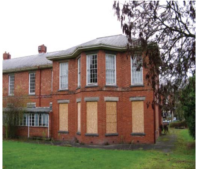
These unoccupied 'positive' buildings must be protected from further deterioration