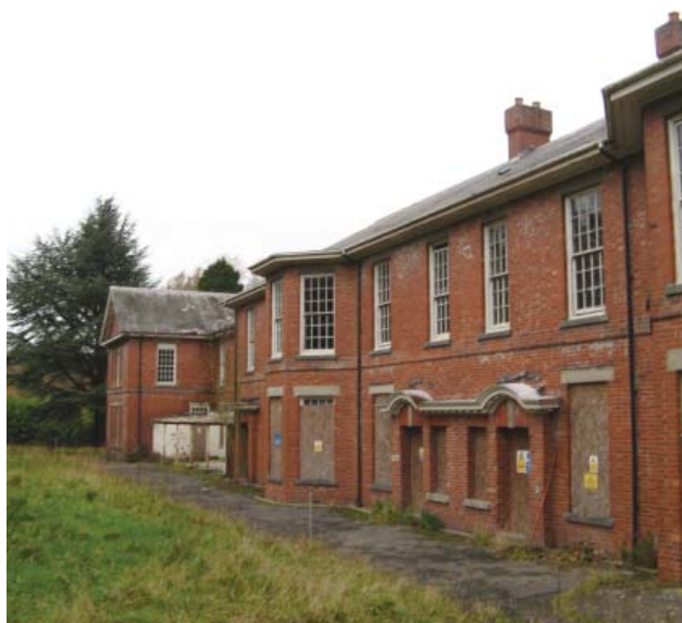
Typical elevation, ward block