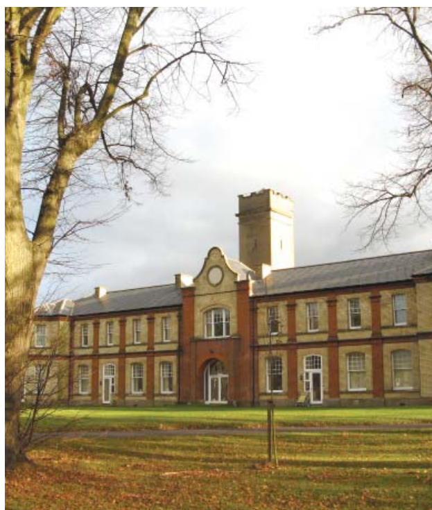
Add Balfour House to the Local List