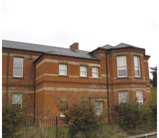
Some of the existing hospital buildings have been retained and converted into flats

Views within the conservation area are constrained by the tall blocks of buildings and many trees. However, the clock turret on Prospect House is a notable local landmark. On the edges of the conservation area, there are long views in a south west direction over Horton Park Farm and its fields, and to the south east, the water tower at Horton Hospital is another focal building.