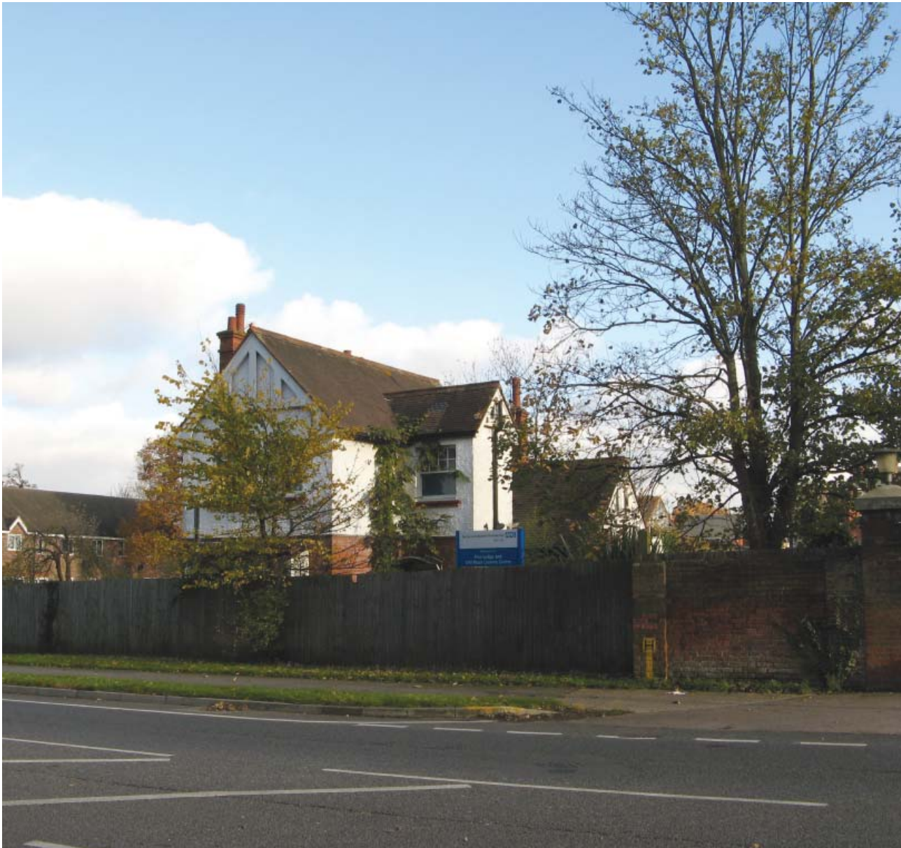
The former lodge to Manor Hospital