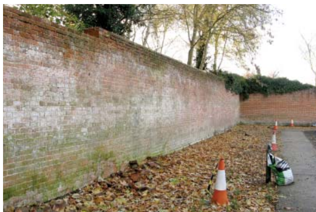
The former kitchen garden wall

geometrical layout of two sections of moat, which lie to the west and south of the house. These separate the Manor House from Horton Lane and also from the various 'service' buildings which are indicated on the map and appear to have been stables and other outbuildings. Of these, only the listed 18th century barn which faces Horton Lane, remains, as well as a few more minor buildings and most of the high brick walls which once surrounded the kitchen garden. Part of the most southerly section of moat also remains, but is so heavily overgrown with trees and shrubbery that it is difficult, even in winter, to plot its course.