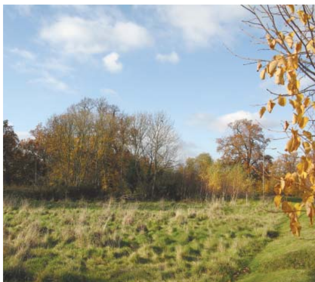
The woodland setting between The Manor Conservation Area and Epsom Common

The Cluster lies on gently undulating or flattish land, at about 60 metres above sea level. The soil below is London Clay mixed with medium clay loams, which can result in water logging in the winter months, and to very dried-out conditions in the summer. Areas of gravel in the area have historically been quarried for building materials.