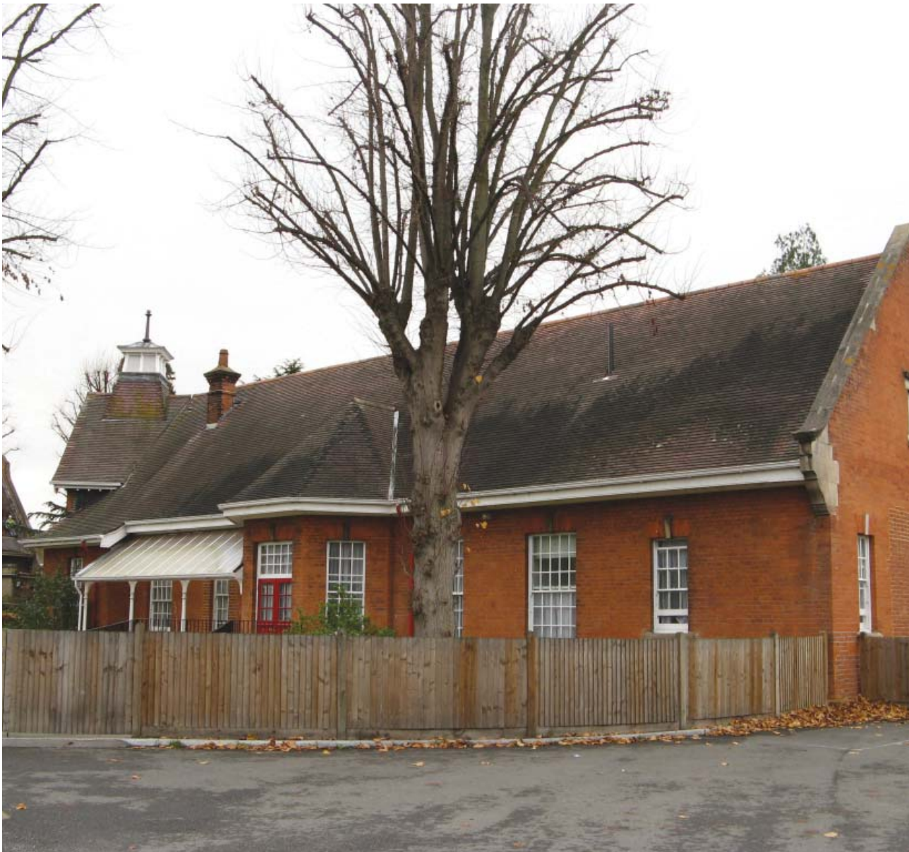
Sheiling villa, St Ebba's Conservation Area