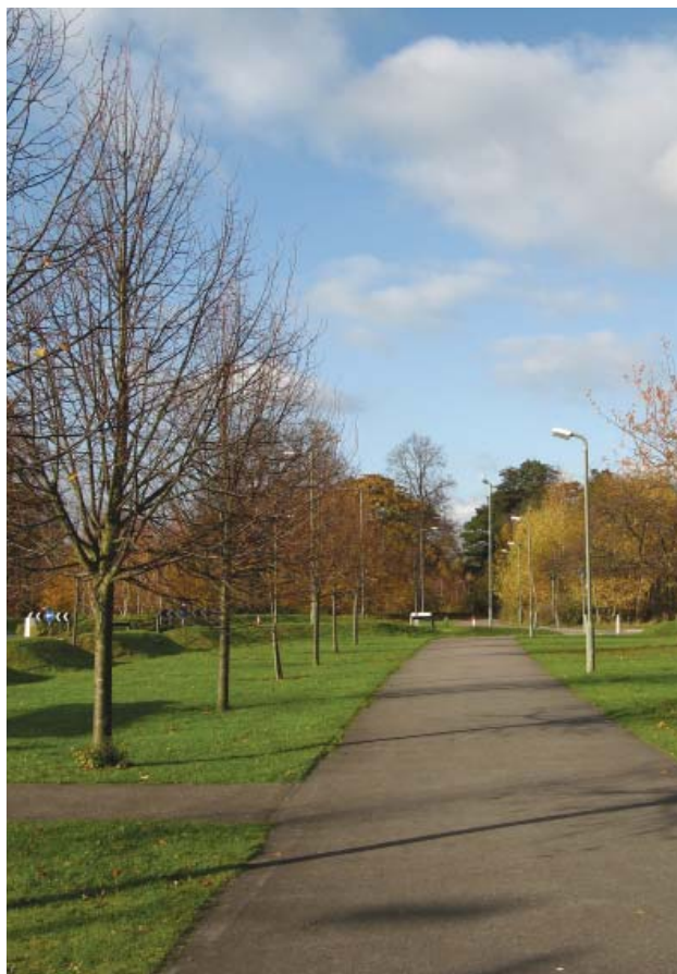
Hard landscaping and planting has been carefully detailed

The map of 1866 also shows the layout of the site (then called Horton Place) with a narrow carriageway from Christ Church Road, parts of which still exist but which has been subsumed within the new access road for the more recent housing called Chertsey Lane. The former lodge, which once marked this principal entrance, remains to the south east of Cuddington Glade, facing what is now called Oak Glade. Of note on the historic map are the fish ponds, which curve around the Manor House on two sides to the north and east, and the more