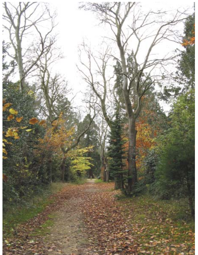
Trees are very important and need to be protected