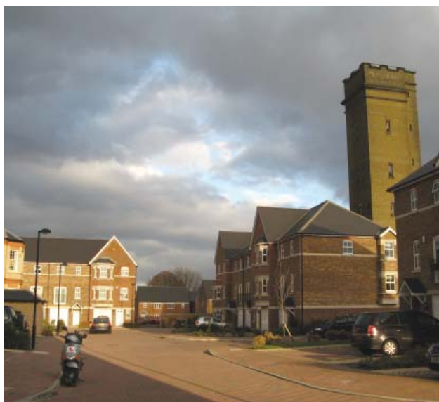
New development at Horton Hospital

A more detailed assessment of each of the five hospital sites is included in the subsequent chapters of this Character Appraisal.