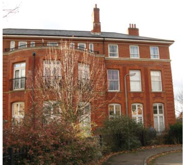
Horton Manor House - old garden front