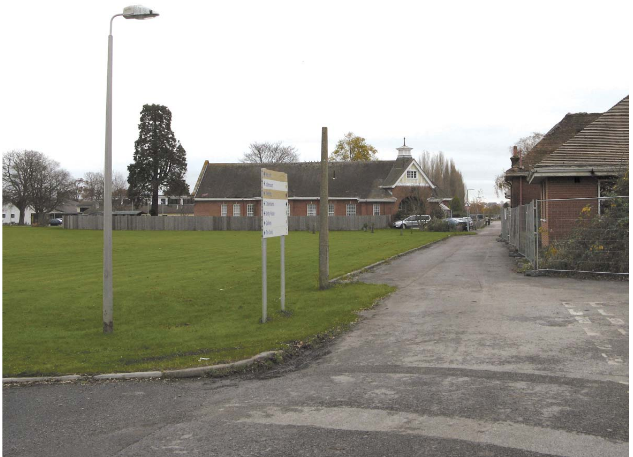
Improvements to the public realm in the St Ebba's Conservation Area are needed