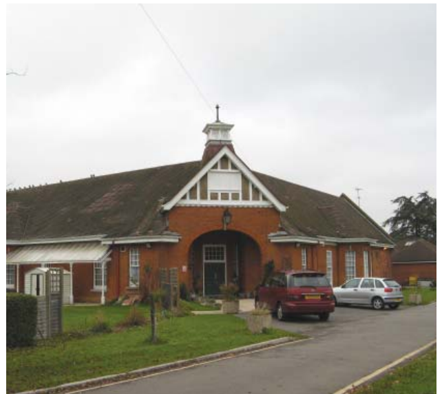
Listed villa in the St Ebba's Conservation Area

The survey work for this document was carried out in October and November 2008. The omission of any feature in either the Character Appraisal or the Management Proposals does not imply that it is of no interest, and because both will be subject to regular review, it will be possible to amend any future documents accordingly.