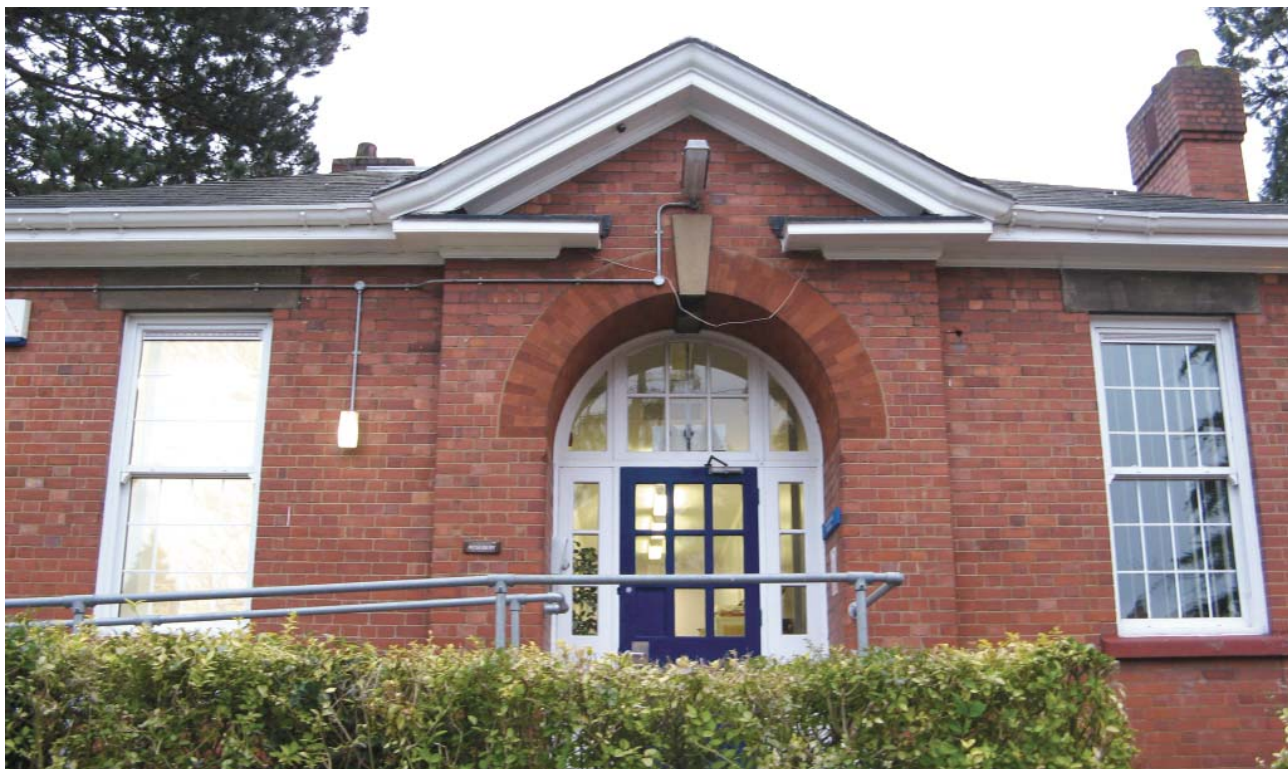
Some of the historic buildings in West Park Hospital are still in use by the Health Authority

The 2000 Local Plan, which summarises the 1995 Plan, provides a framework for the redevelopment of the four hospitals. Broadly, development of the sites would allow the demolition of many of the late 19th or 20th century buildings and their replacement, based on strict 'footprint' criteria, with houses, flats and some communal facilities. The protection and enhancement of the landscape setting and mature trees around the former hospital buildings, which form such an important part of the area's character, was also insisted upon. A Hospitals Cluster Proposals Map, dated May 2000, shows the buildings as they then