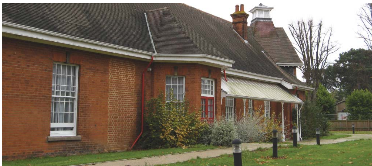
Verandah to Sheiling villa