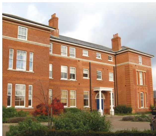
Horton Manor House