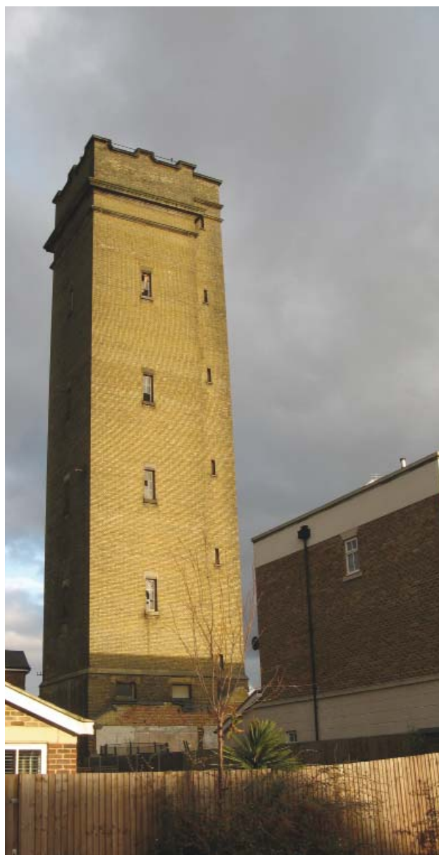
The water tower