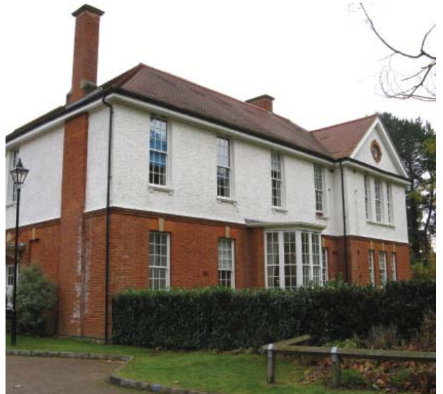
Add this former villa into the Long Grove Conservation Area