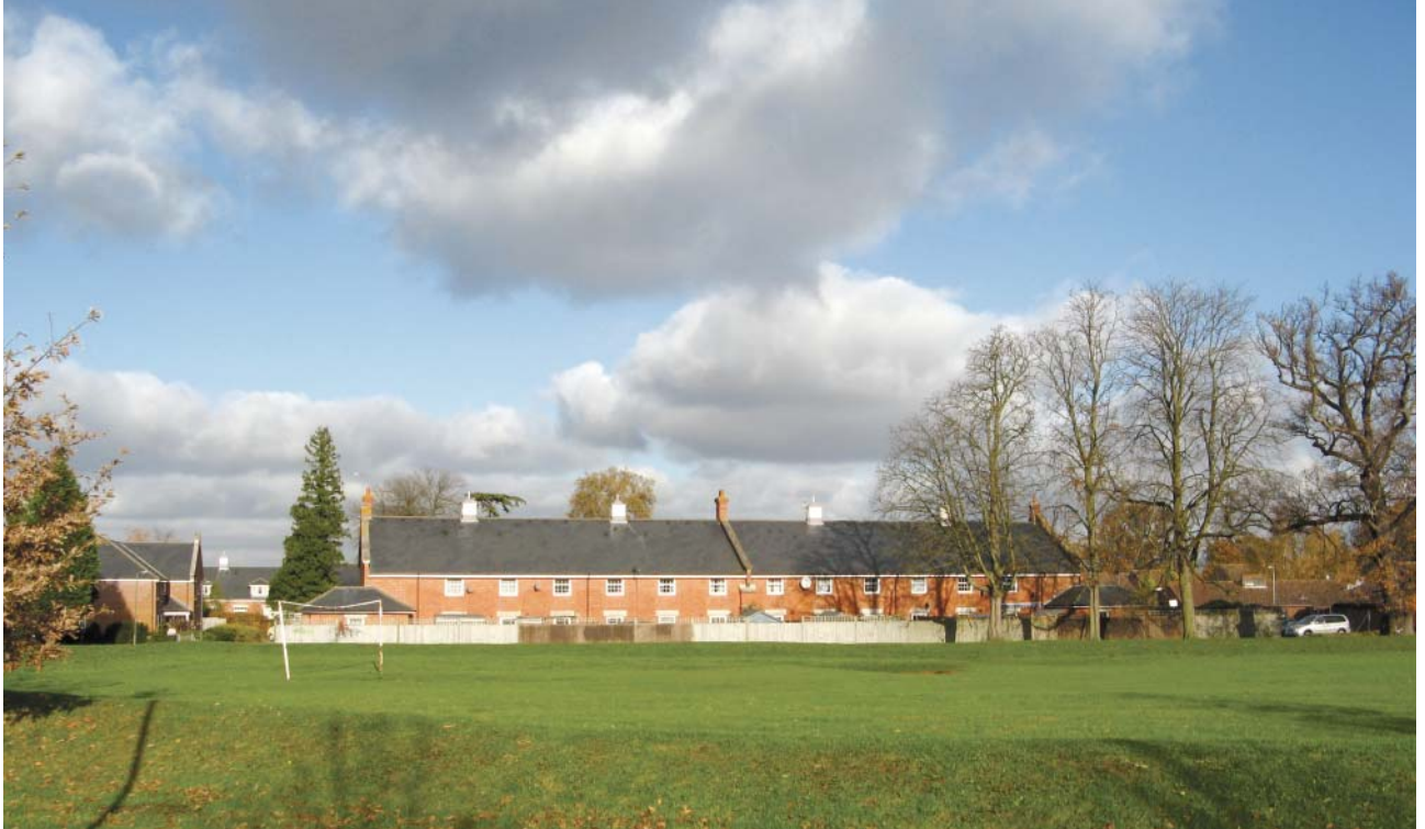
View of the converted buildings in Helm Close across the adjoining playing field

Finally, on the western edge of the conservation area, facing Horton Lane, one of the original hospital lodges, presumably dating to c1890, remains. This is a picturesque composition of single and double height elements, enlivening by timber details to the gables, tall red brick chimney stacks and the use of white painted rough cast and red brick. This appears to be in residential use in association with a modern building called Pine Lodge which lies to the immediate north of the Garden Centre, outside the conservation area boundary, which is in the ownership of the local NHS trust.