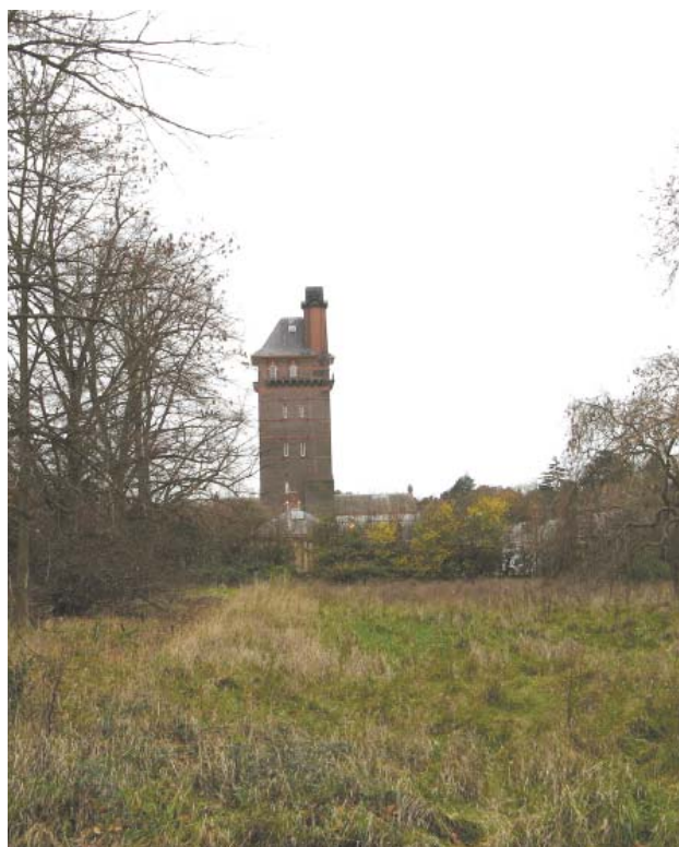
The listed water tower is a key feature

These three single storey blocks are built from red brick with stone lintels and concrete cills to the windows, which have inward opening top lights. Chimney stacks and ventilation turrets on the ridge decorate the shallow pitched slate roofs. Occasionally the roof is also relieved by a pediment detail, defined by white painted timber cornice. Two of the buildings are empty and in poor condition, having suffered from the leadwork to the valleys being stolen. A third building is well maintained and apparently in use by the NHS.