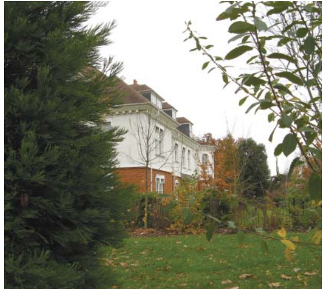
Add this villa to the Long Grove Conservation Area