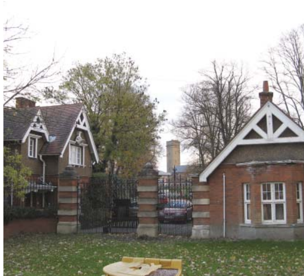
View past former Horton lodges to the water tower beyond

On the west side of the site there is an NHS unit called Horton Haven. Adjacent to it, two existing villas which lie within the conservation area are being refurbished and a new link block created between them. These will accommodate new mental health care patients. Further new housing and some retail uses have been completed at the corner of Horton Lane and Chantilly Way.