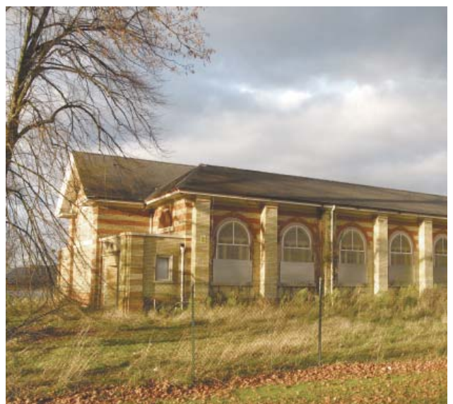
The listed chapel is a building-at-risk