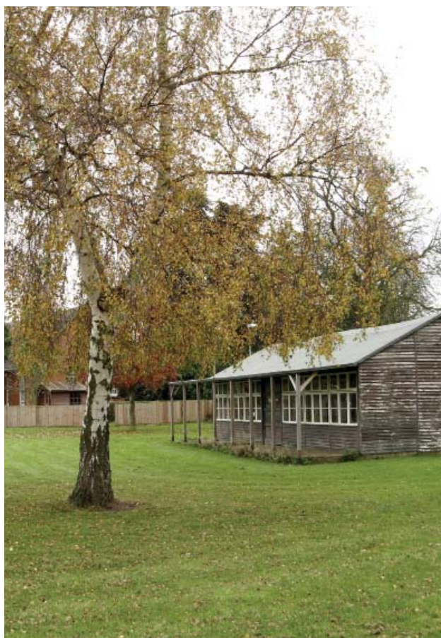
The cricket pavilion