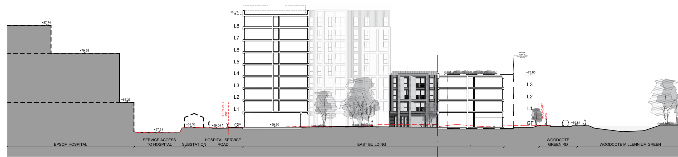
SITE SECTION BB'