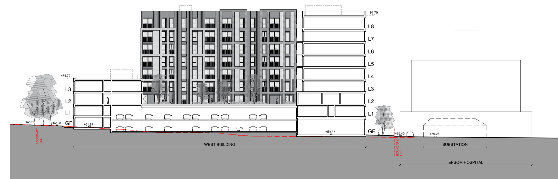
SITE SECTION EE'