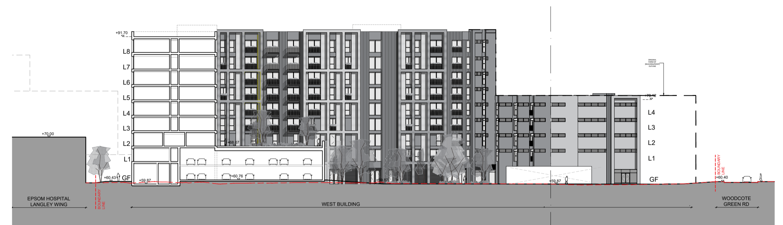
SITE SECTION CC'