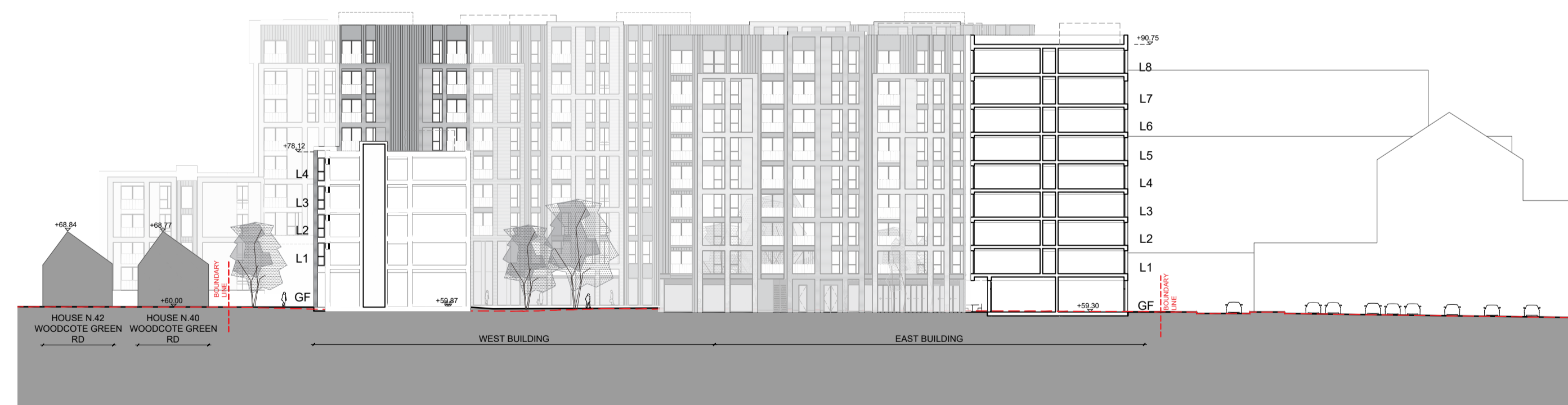
SITE SECTION DD'