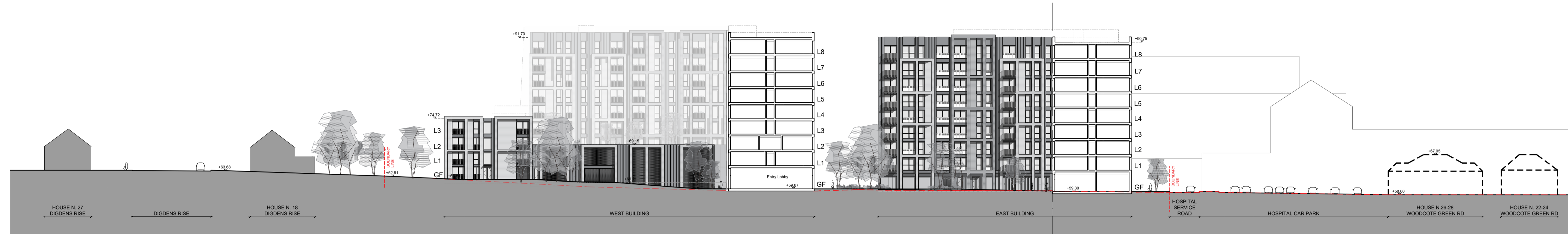
SITE SECTION AA'