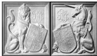
King George Playing Field