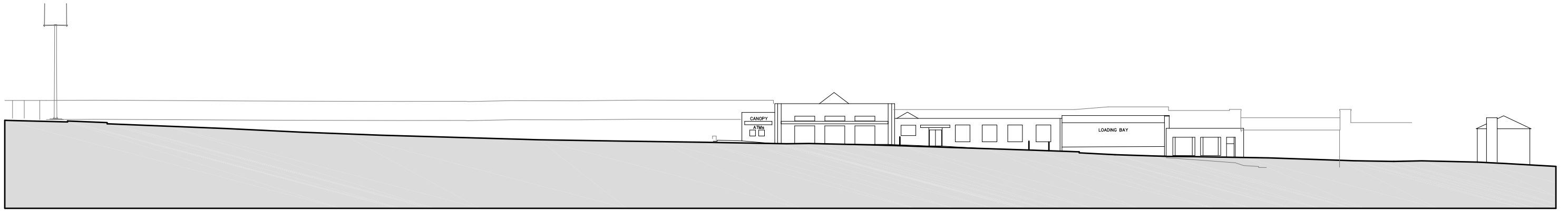
E1 EXISTING ELEVATION SCALE: 1:250 (A1)